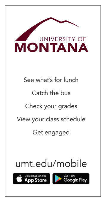
Figure 2: Back of card