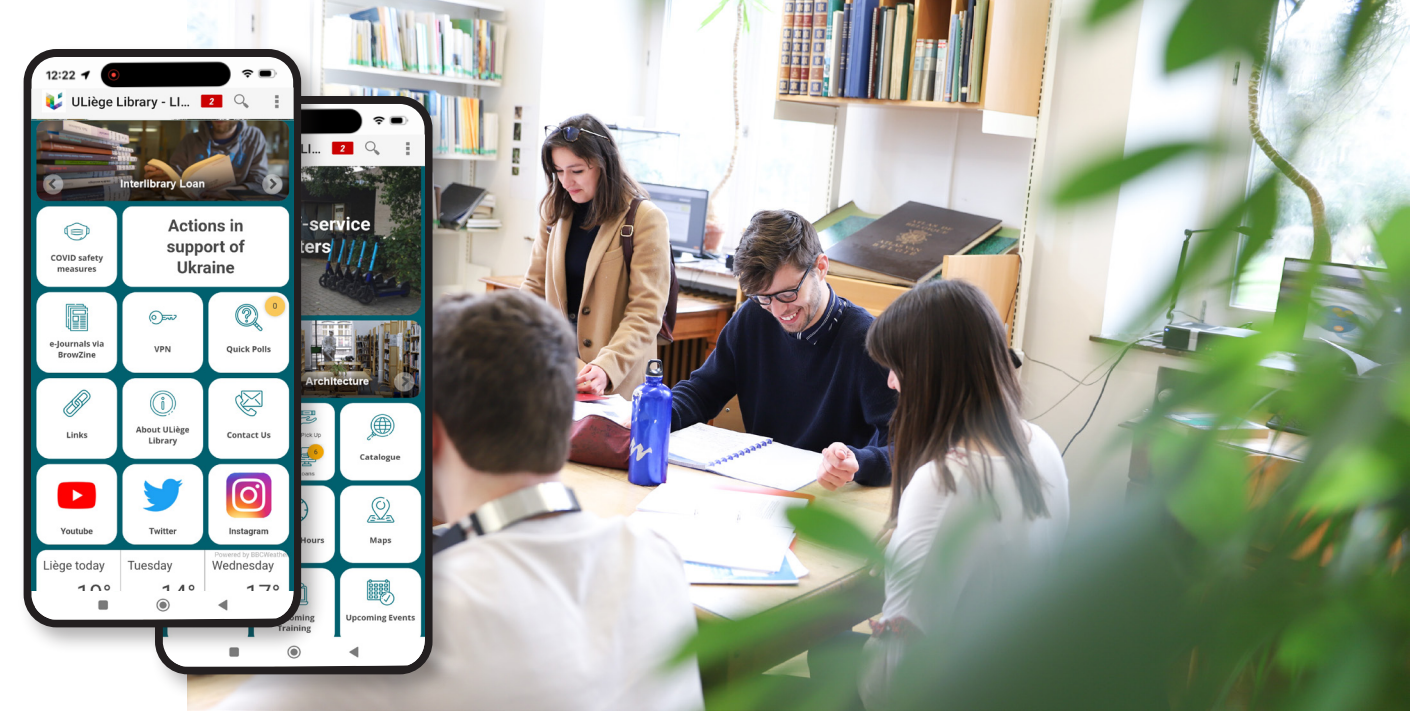
ULiège