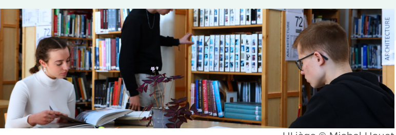
ULiège © Michel Houet

The ULiège library operates 15 branches across its various campuses and has 110 staff members. Strongly involved in promoting information literacy and open access, the library offers access to more than 700,000 ebooks and 83,000 electronic periodicals. In addition, library holdings include 6,500 manuscripts among approximately 1.5 million print resources.