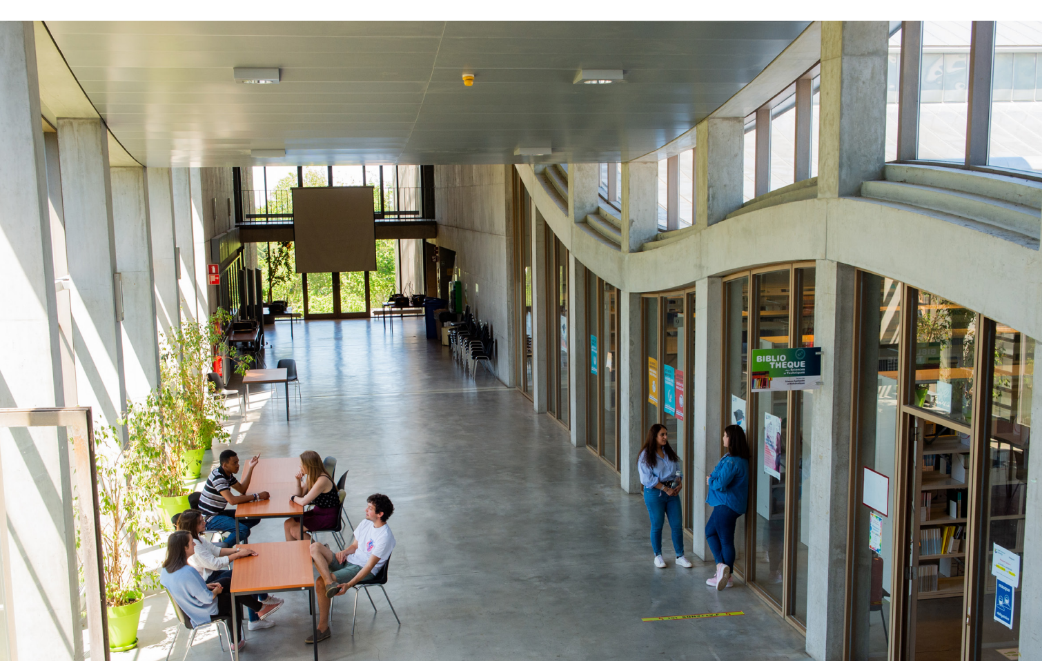
ULiège © Sandrine Seyen